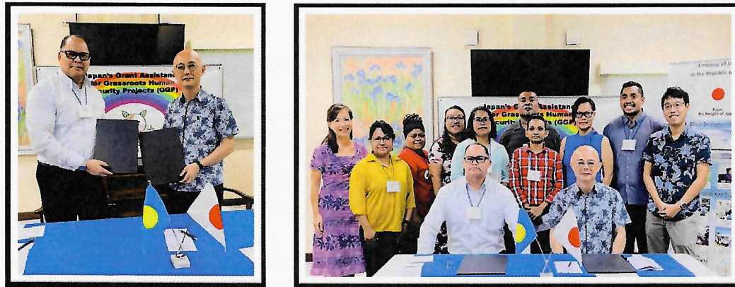
Signing of Contract on December 23, 2022.

The Embassy of Japan in the Republic of Palau awarded the sum of $182,800 to the Palau Public Utilities Corporation's Wastewater Operations for the acquisition of a Vacuum Truck pursuant to a Grant Contract executed between the Embassy of Japan and PPUC Wastewater Operations on December 23, 2022, as shown below: