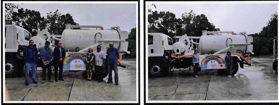
Handover ceremony on February 28, 2024

On February 28, 2024, the Vacuum Truck was turned over to the Palau Public Utilities Corporation’s Wastewater Operations in a formal Handover Ceremony shown below: